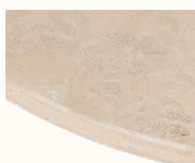
Coffee Waste Light