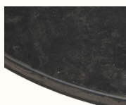
Coffee Waste Black