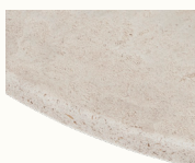
Wood Waste Grey

The tabletop of the Mater Café Table is made of Matek™. Innovative technology allows us to recycle fibre-based waste materials with recycled plastic waste. The table has a simple, clean design making it suitable for various settings. A slim cylindrical metal base ensures the table's stability and offers free placement of chairs.