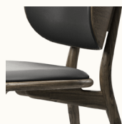
Sirka Grey Stained